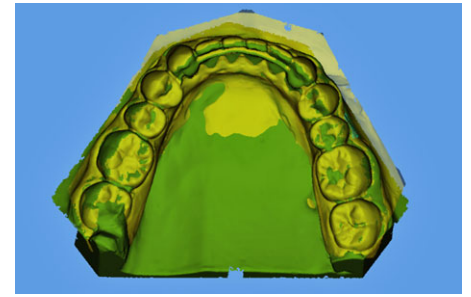
Fig. 1. Stereolithography (STL) image superimposition of baseline (yellow) and 1-year (green) follow-up models.

In case patients had received more than one dental implant, one of these was randomly chosen for the linear and volumetric analysis in each pair of casts. Measurements were performed by a calibrated, blinded outside evaluator. The following measurements were performed: